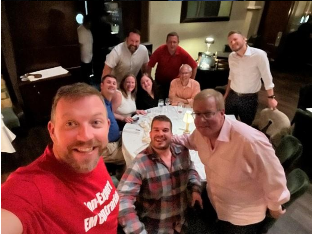
Kentucky Councillors ACEP22