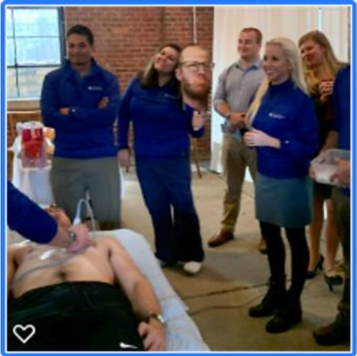
University of Kentucky took home the Battle of the Bluegrass Award!!